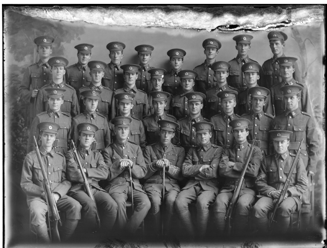
Full length portrait of thirty one New Zealand Army cadets. Herman Schmidt photo, ref 31-WP8303, Sir George Grey Special Collections.

The NZ Legacy Editorial Committee invites contributions for the three NZ Legacy issues to be published in 2014, along the theme of the First World War — the people, the memories, New Zealand during the war etc.