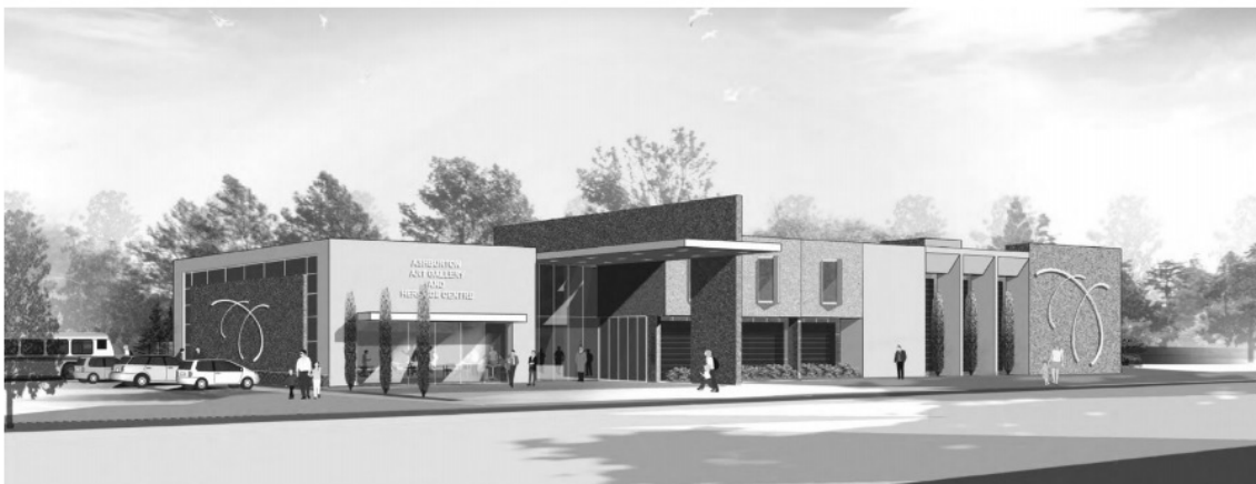
The top of the Ashburton Museum's newsletter.

preserving the foundations of tomorrow's Ashburton