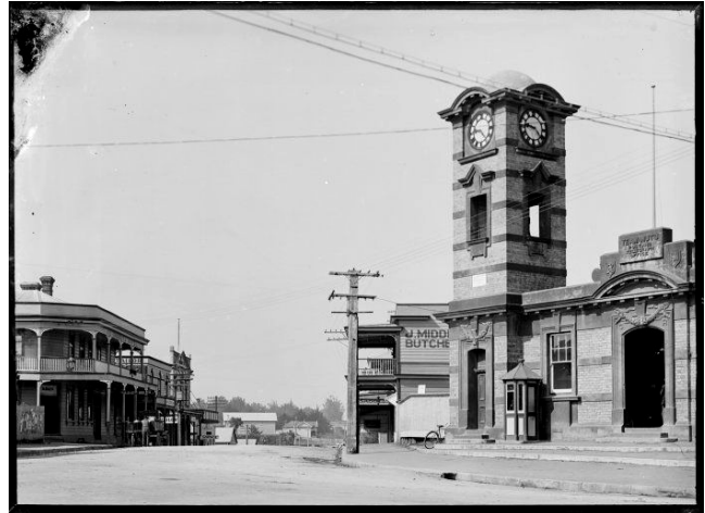
Sloane Street, Te Awamutu, showing Te Awamutu Post and Telegraph Office, Te Awamutu Hotel and various other buildings. Photographed ca 1920 by Sydney Charles Smith. Ref 1/2-045657-G, National Library.

Day Two will be taken up with our AGM, instructive/informative addresses, an annual dinner and the showing of the early film Rewi's Last Stand . The