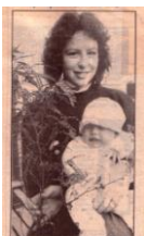
New baby, new tree