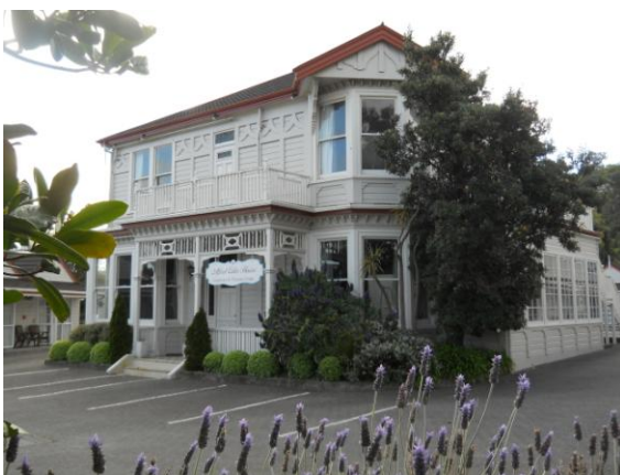
Alfred Coles House today